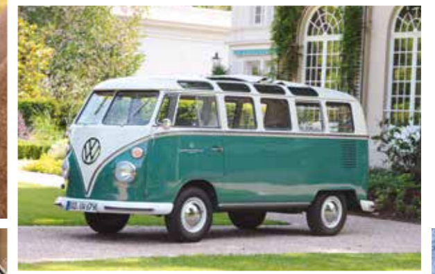
Brenners Park-Hotel & Spa · Villa Stéphanie