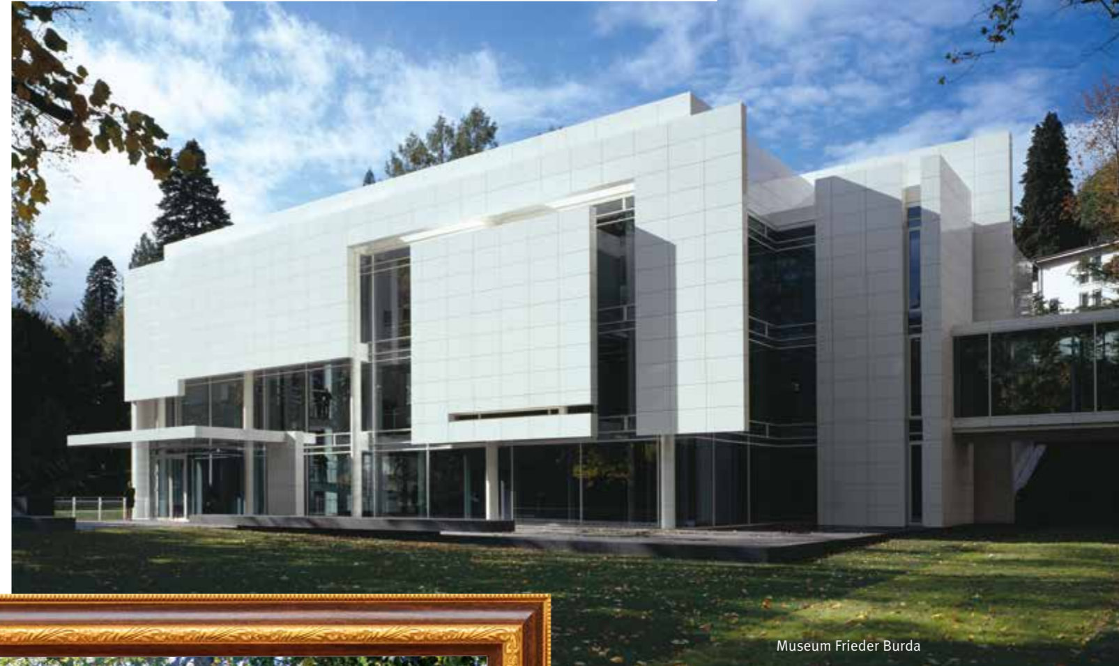
Museum Frieder Burda

Gerhard Richter’s painting “Candle” (Kerze), painted in the early 1980s, depicts much more than a mere candle. Critics of the East German regime often placed candles in their window at night: a silent protest to which Richter has created a lasting monument. The painting hangs in Museum Frieder Burda.