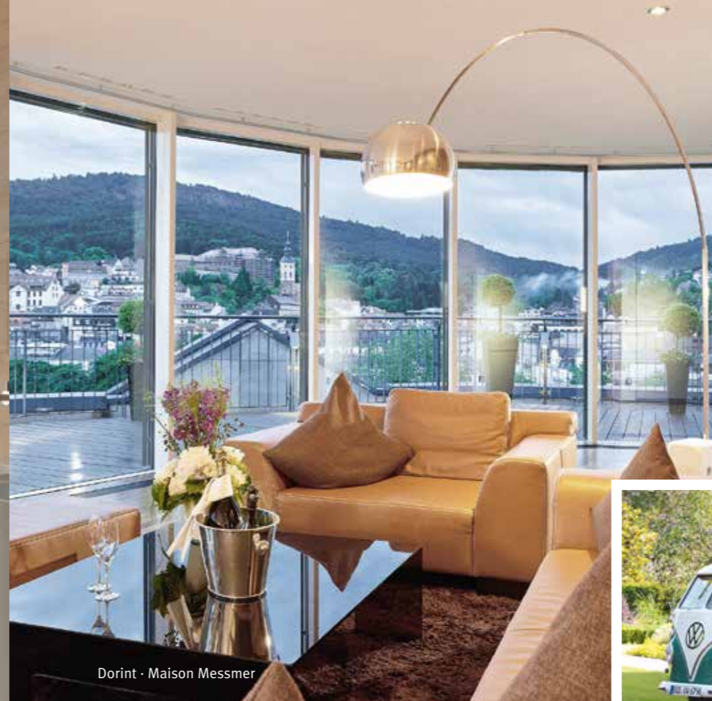
Dorint · Maison Messmer