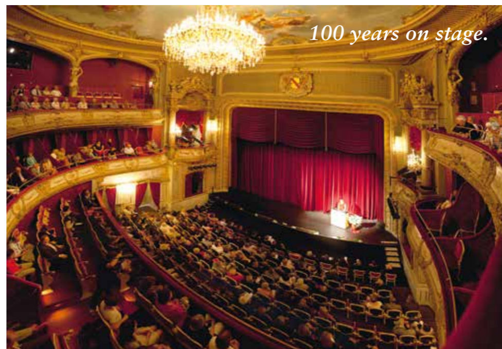
100 years on stage.

It’s one of the most beautiful theatres in Germany and has had its own ensemble for the past 100 years. In addition to the classics, Theatre Baden-Baden stages contemporary plays and even world premieres. Theatre is much more than mere entertainment – it offers an opportunity to provide a fresh perspective on life. Embracing this approach, the theatre builds its program around a different theme every season, posing a question, for example: “WHO IS WE?” – in political and individual terms. Every play provides its own unique answer.