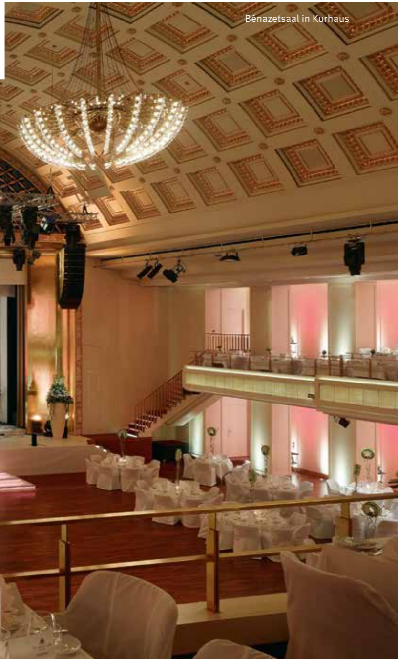
Bénazetsaal in Kurhaus