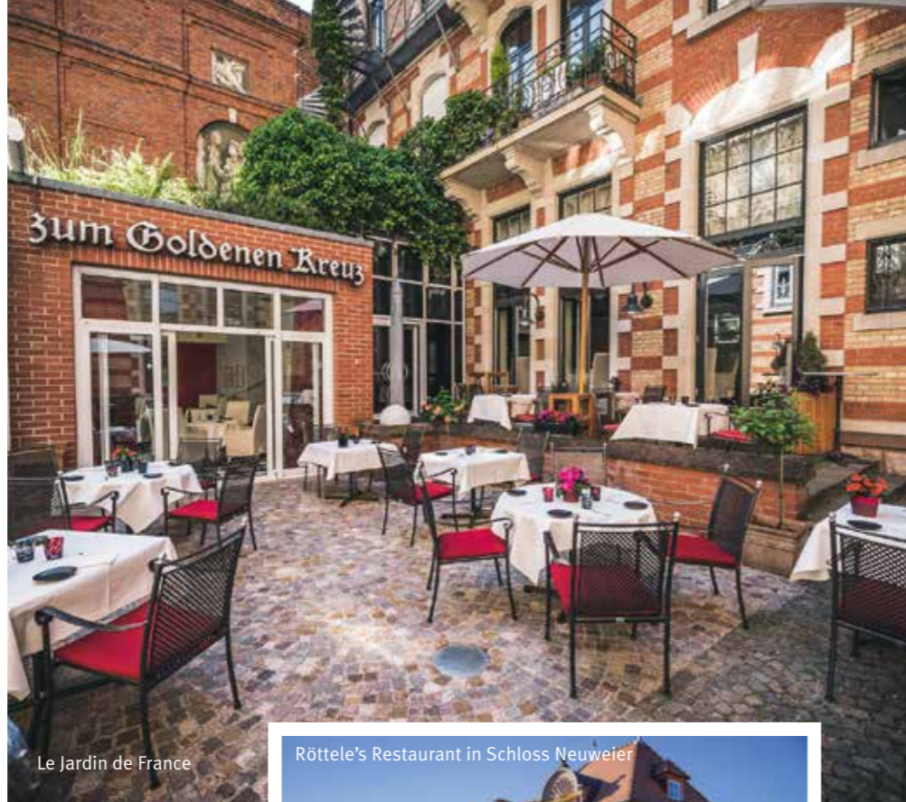
Le Jardin de France

hectares: that's the size of the enchanting "culinary triangle" – the wine-growing region bounded by the three villages of Varnhalt, Steinbach/Umweg and the state-certified health resort, Neuweier. The territory constitutes Baden-Baden's "Rebland" and is one of Germany's three largest self-contained viticulture and wine enjoyment regions.