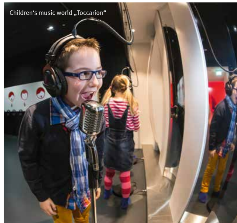
Children’s music world „Toccarion“

Brahms lived and composed many of his famous works here, the world’s top orchestras pass through in a non-stop stream and time and again there are opportunities to actively take part. Let your little ones roam through “ Toccarion ”, a music world created for children, located inside the Festival Hall Baden-Baden and run by the non-profit Sigmund Kiener Foundation. Its vocal and rhythm laboratory and tone room give children opportunities to explore the many facets of listening pleasure.