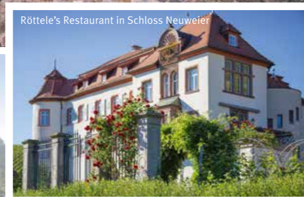
Röttle's Restaurant in Schloss Neuweier